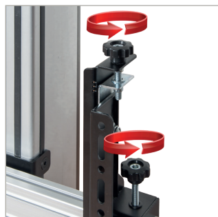
8 point tool-less micro-adjustment for seamless screen alignment