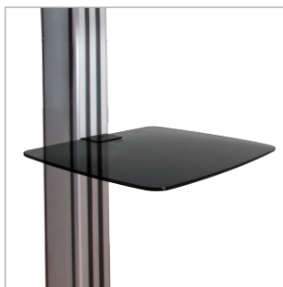
Fit System 2 compatible accessories such as shelves without using collars