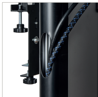
Cable management covers hide untidy cables and add to the stylish finish