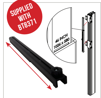
Screen spacer designed to eliminate calculations and guess work when installing horizontal rails